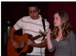
Guitar Workshop: Commerce, TX

This year, we are turning toward a new, interactive DVD format that allows greater flexibility and is flexible for more learning and teaching styles.